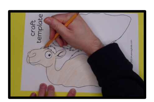
Color the camel images.