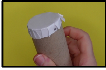
Cover one end of the cardboard tube.